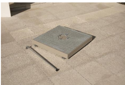
Left - Napoli Cantilever Parasol Freestanding Base (4PBFC.04)

The Napoli Cantilever Parasols (4NAC35S.302 and 4NAC40S.302) require either a Napoli Cantilever freestanding base (4PBFC.04) or a Napoli Cantilever Parasol In-ground base (4PBUC.04). The freestanding base must be weighted with 12 paving slabs 45cm x 45cm x 3cm, which are not included.