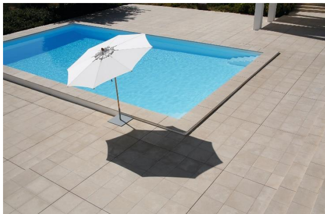
Napoli Parasol 2.8 metre Ø - 38mm pole with tilt (4NA28C.302).

Our range of Napoli parasols are available in circular, rectangular, or square form with either a traditional pole or with cantilever mounting. They feature either a tilt mechanism or a telescopic mechanism.