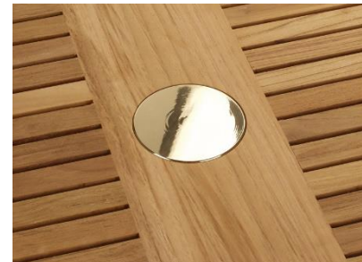
Table Blanking Cap - Brass (4PR.00)