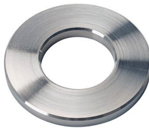
Table Reducer Ring - Stainless Steel 38 (4PRSS.38)