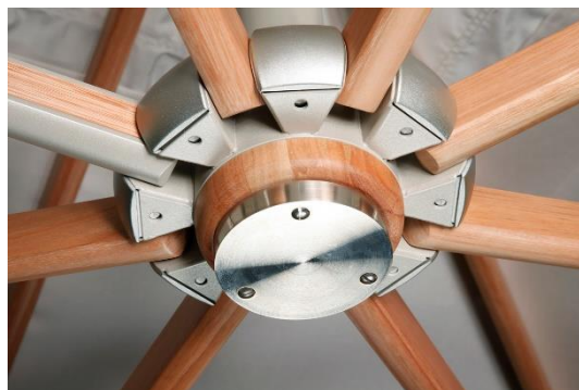
Napoli Cantilever Parasol 4 metre square (4NAC40S.302)