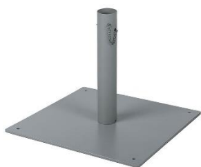
Left - Parasol Standard Base 61 (4PBL)

When ordering a base, the pole diameter of your parasol determines the correct size of base to order. For example, the Napoli Parasol 2.8 metre (4NA28C.302) has a 38mm pole and can be used with either a Parasol Standard base 38 (4PBS), a Parasol Freestanding Base 38 (4PBFS), a Parasol Floor Fixing Base 38 (4PBFFS) or a Parasol In-ground Base 38 (4PBUS). Our Parasols have either a 38mm or 61mm diameter pole. Special bases for high dining and pedestal tables are also available.