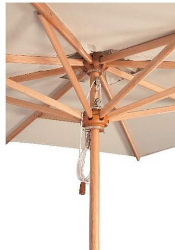
Napoli Parasol 3.5 metre Ø - 61mm pole (4NA35C.302). This parasol has a Telescopic mechanism to allow it to close over a table.

Sunbrella® canopy: colour available is Canvas .302. All our Napoli standard and cantilever parasols feature this fabric, which is a durable, 100% solution dyed acrylic. The colour is locked deep inside the synthetic yarn, giving it excellent resistance to the fading caused by sunlight and cleaning.