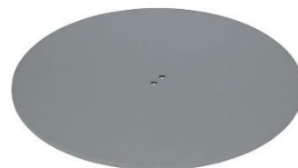
Right - Parasol Pedestal Base 59 (4PBPL)